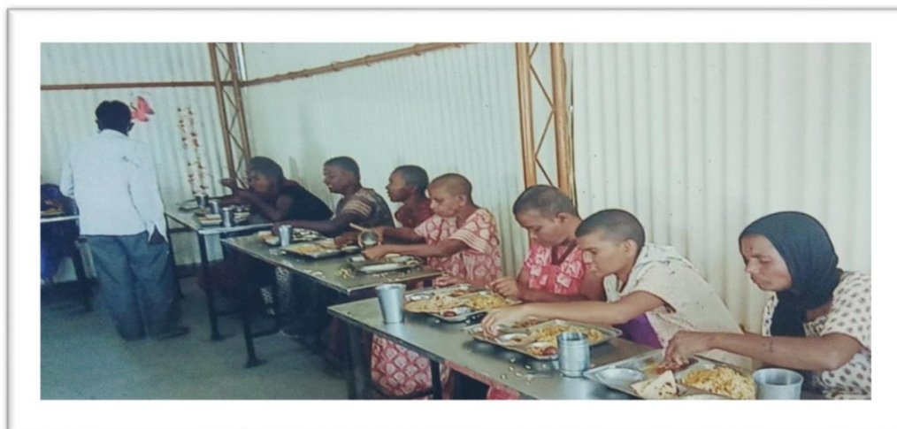
During meals for DIVYANG JAN at Seva Sankalp Pratishthan, Palaskhed.

On the background of Corona, help was given in the form of food and hygiene in the ashrams of mental patients in the district. Rs. 7000 was spent for food donation.