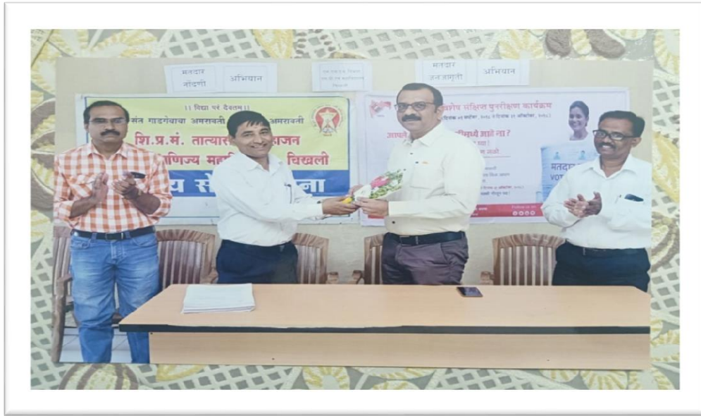
Hon'ble Tehsildar while guiding students regarding voting awareness.

To educate the public about voting through National Service Scheme and register new youth as voters, a voter awareness rally was organized on September 4. Along with this, students guided that every citizen should right to vote in order to increase the voting percentage by going to the houses of the locality before Lok Sabha elections.