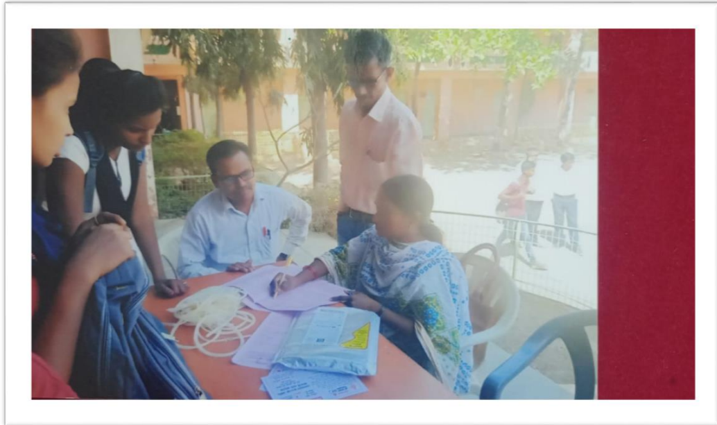
Students giving blood group samples for AIDS testing