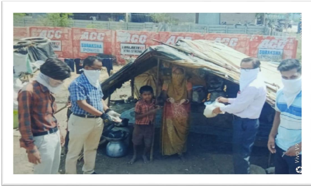
Program officer distributing grain during the corona virus pandemic

Food grains and vital utensils were distributed to needy people living in tents in Chikhli Nagar during the global epidemic of Corona. Among them, 67 families from other states were given food grains and essential aid through the National Service Scheme. Students participated in this activity, even in severe pandemic situation, wearing masks and observing social distance.