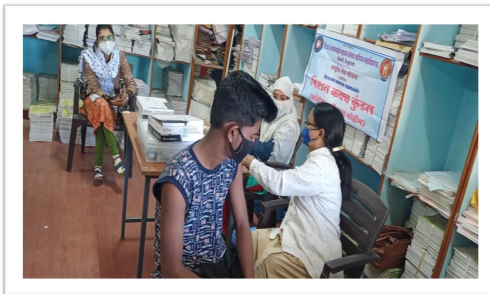
A team of the Government Medical Department while vaccinating

Corona vaccination was organized by the Maharashtra government in order to get out of the epidemic of global compassion and prevent this disease from happening. The National Service Scheme and the college participated in this initiative of the government. For this vaccination, the rural hospital Chikhli and the students of the college brought the senior citizens of the surrounding area to the college to vaccinate them. In this program, 210 students got themselves vaccinated while 125 citizens took advantage of this vaccination in the college. It was also challenged to remove the misunderstandings related to vaccination by telling journalists and direct information so that citizens come forward for vaccination.