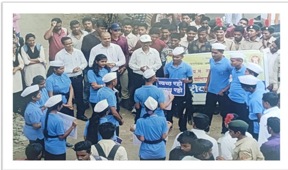
National Seva Yojana volunteers in sensitization of society through street play for voting awareness.