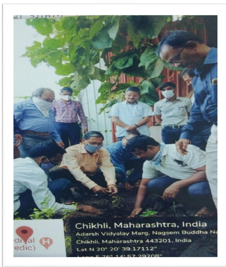
Students and teachers, planting trees in the college premises.

Through the National Service Scheme, 40 trees were planted in the college on August 15, 2020 and in Selut area of Chikhli on September 1, 2020 with the aim of making the students understand the importance of tree plantation and creating awareness in the society. 55 trees were planted on September 5, 2020 at Duttak Village Palaskhed Sapkal. Neem saplings were mainly cultivated in this.