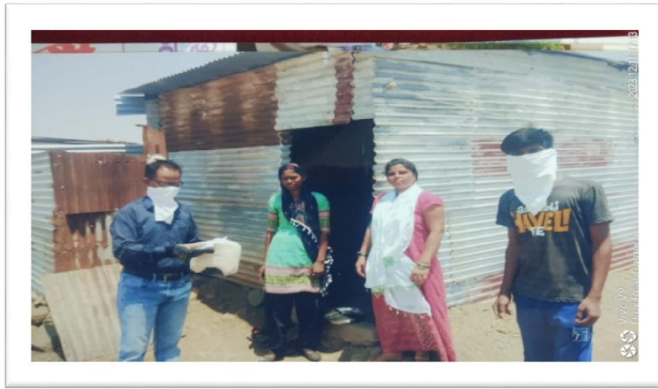
Program officer distributing grain during the corona virus pandemic